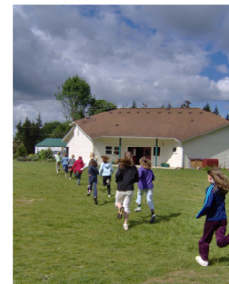
Our Middle School students are remarkable.

Olympia Waldorf School is a non-profit organization established in 1985. OWS is situated on several acres of field, garden, and woodland, in rural East Olympia. Our campus includes Prairie Hall, a historic school building built in 1914, an impressive Middle School building, and a charming Kinderhaus, complete with Kinderwoods. OWS is located just 15 minutes from downtown Olympia.