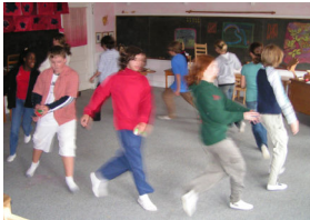
Eurythmy—speech through movement—builds self-esteem through the mastery of the body.

Olympia Waldorf School offers a developmentally appropriate, experiential approach to education. We integrate the arts and academics for children from preschool through eighth grade. Waldorf education aims to inspire life-long learning in all