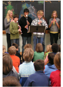
All grades students learn to play beautiful music on recorders.

range of Main Lessons, including language, arts, science, mathematics, history and geography, are taught by the class teacher in blocks of three to six weeks. Our program cultivates academics artistically through practical activities to awaken each student’s thinking, creativity and will. This includes movement, foreign language, handwork, painting, beeswax or clay modeling, music, drawing, games and drama.