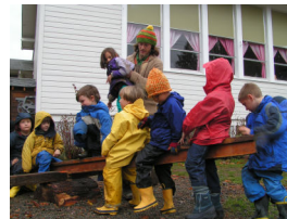
In the Waldorf kindergarten, physics is experienced through play.

Our Waldorf Early Childhood program is warm and welcoming and utilizes a full range of creative activities appropriate to the young child, such as creative play, rhythm and movement, finger plays, singing and circle games. A weekly rhythm is established in which the children experience bread baking, modeling with beeswax, watercolor painting, beeswax crayon drawing and seasonal crafts. Fairy tales and nature stories are told and are further enlivened through puppet plays and simple drama. The program is pre-academic, allowing for the essential “work” of the young child—to play, to learn to interact socially, to function in a rhythmic way, and to prepare for the academics of the grades. Early Childhood teachers provide a solid foundation for academic learning by developing and protecting the child’s imagination, inspiring their sense of wonder, and instilling in them a reverence for life.